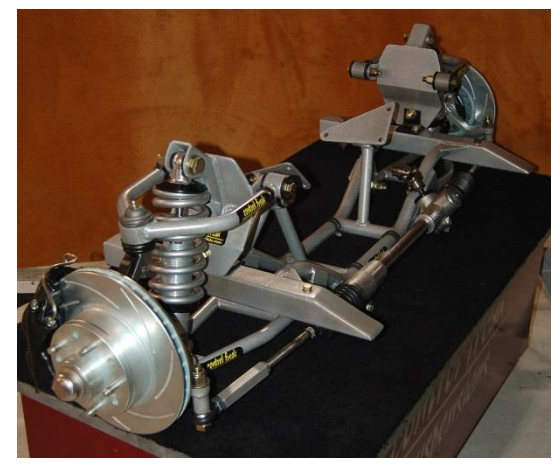
Independent Front Suspension Systems Almost every AMC car since 1964