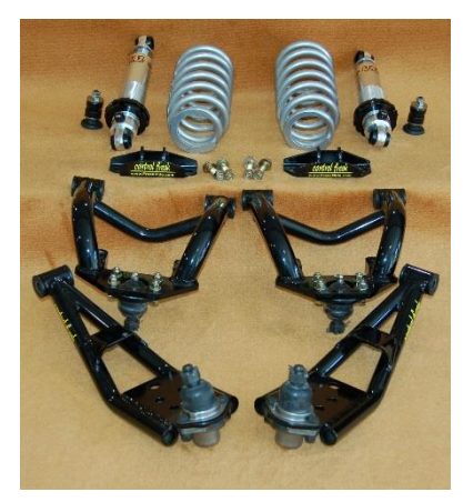
Coil-Over Conversion Kits All 1970+ AMC Vehicles