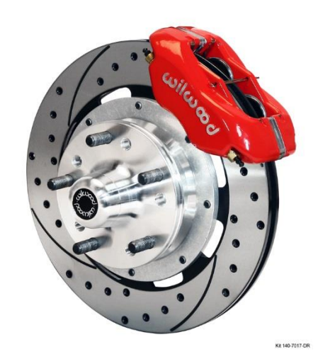
Brake Systems From Wilwood Engineering