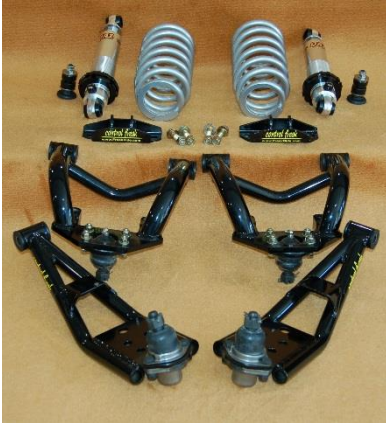
Coil-Over Conversion Kits All 1970+ AMC Vehicles