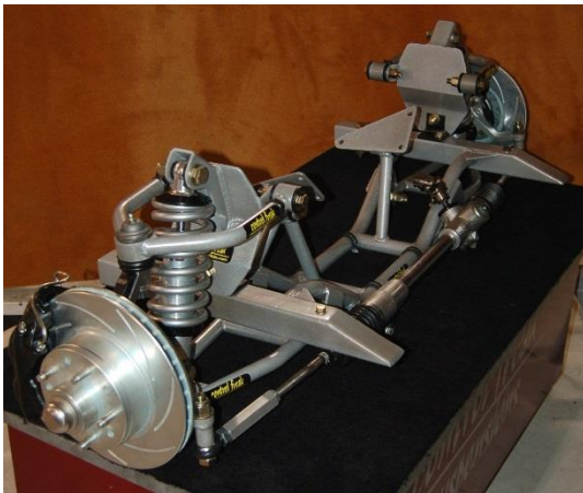
Independent Front Suspension Systems Almost every AMC car since 1964