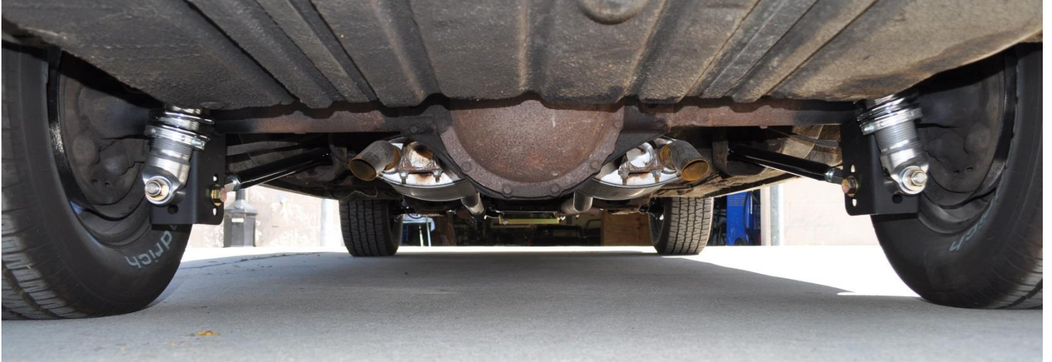
Rebel, Ambo, Matador 4-Link Rear Suspension System (RS-1500-1540)