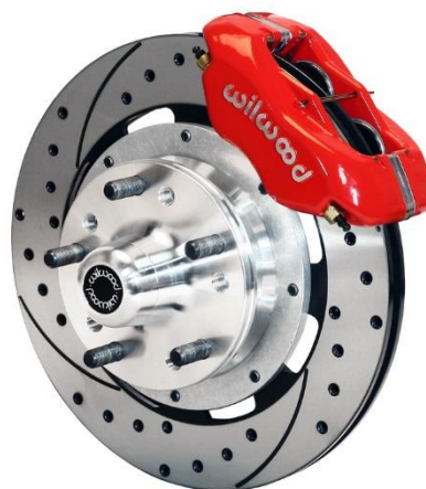
Brake Systems From Wilwood Engineering